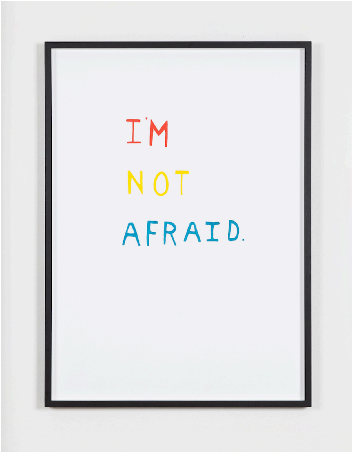
Christian Holtmann I'm Not Afraid 2016 Öl auf Papier 100 x 70 cm